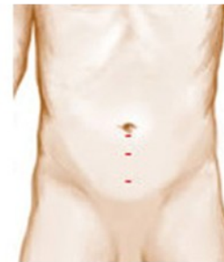
Tiny incisions for keyhole operation

The main advantages of this technique are: