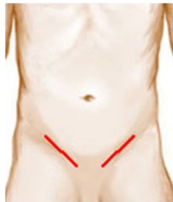
Large incisions for non-keyhole operation

Inguinal Hernia –The Totally Extraperitoneal (TEP) Repair – is a “keyhole” technique for inguinal hernia repair now internationally recognised as the “gold standard”